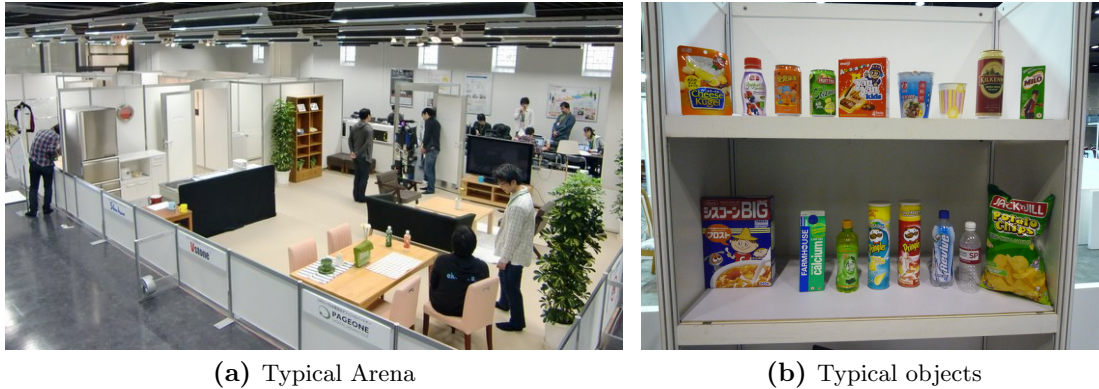
Figure 3.1: An example of a ROBOCUP@HOMEScenario