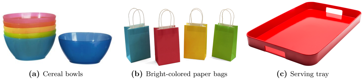
Figure 3.2: Example of object containers

During the competition, objects can be requested based on their Object Category , physical attributes, or a combination of both. Relevant attributes to be used are: