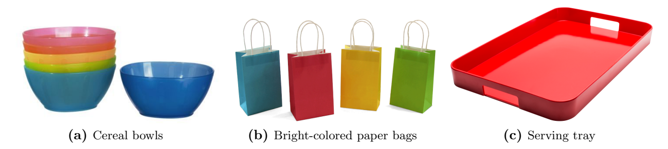
Figure 3.2: Example of object containers

During the competition, objects can be requested based on their Object Category , physical attributes, or a combination of both. Relevant attributes to be used are: