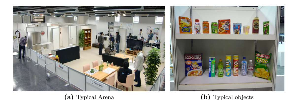
Figure 3.1: An example of a ROBOCUP@HOMEscenario