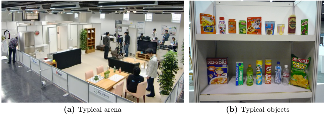
Figure 3.1: Scenario examples: (a) a typical arena, and (b) typical objects.

Drawers: The cupboard must have at least two drawers between 90cm and 120cm from floor level.