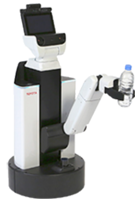
Figure 1.1: Toyota HSR

The robot to be used in the DSPL is the Toyota HSR, shown in Figure 1.1.