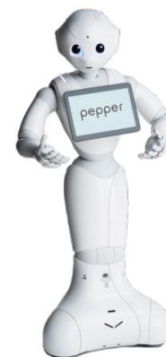
Figure 1.2: Softbank / Aldebaran Pepper

The robot to be used in the SSPL is the Softbank/Aldebaran Pepper, shown in Figure 1.2.